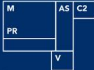
PLANTA ALTA TOP FLOOR